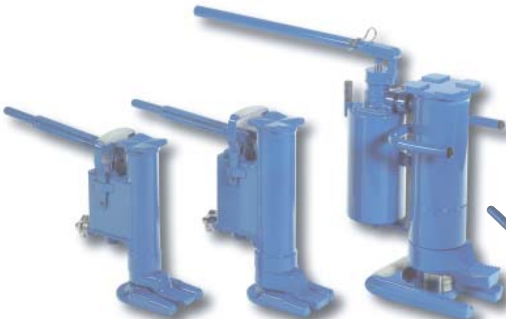
Hydrofor 5 t